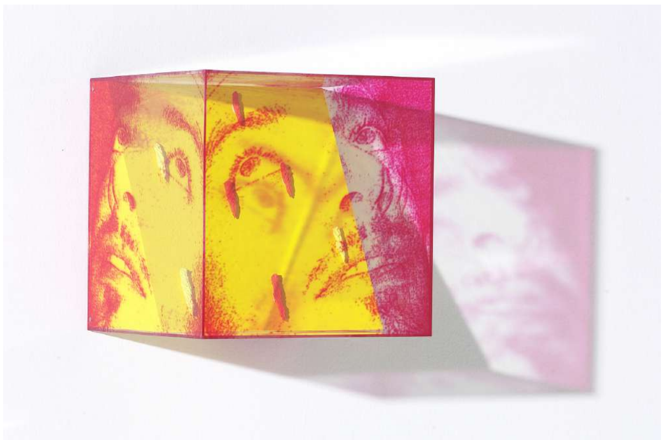
Francesco Candeloro – Eyes 7 – Industrial airbrush on plexiglass / Mixed technique – cm. 42 x 42 x 42 – 2004