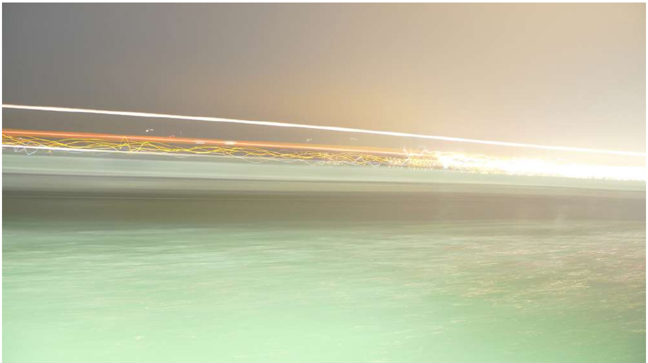
Francesco Candeloro – Times of the Light Venice v2 – Lambda print on photographic paper cm. 40 x 23 – 2015