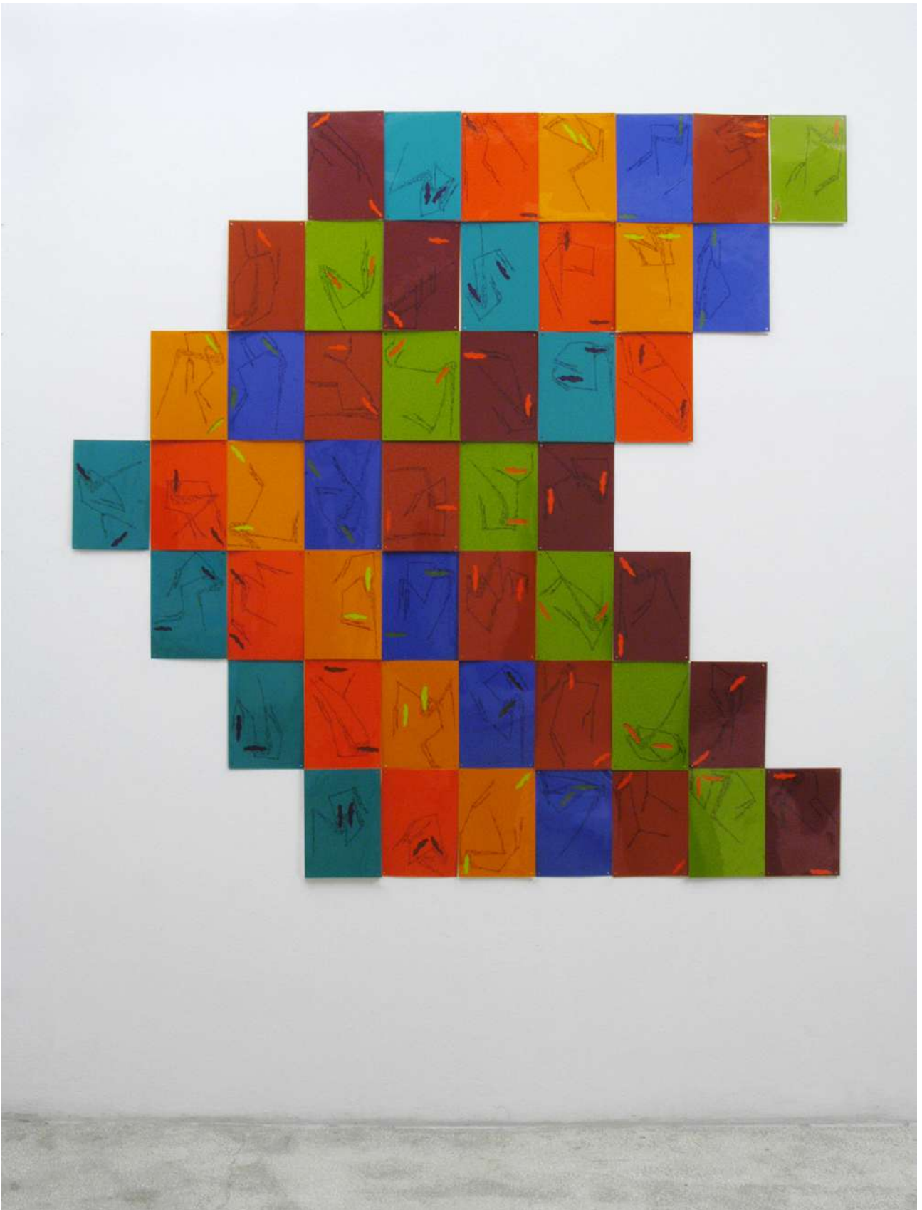
Francesco Candeloro – Directions (Free 6) – Decoupage and marker on acetate, paper and plexiglass – cm. 29, 7 x 21 x 6 (closed artwork) / cm. 210 x 208 (open artwork) – 2006