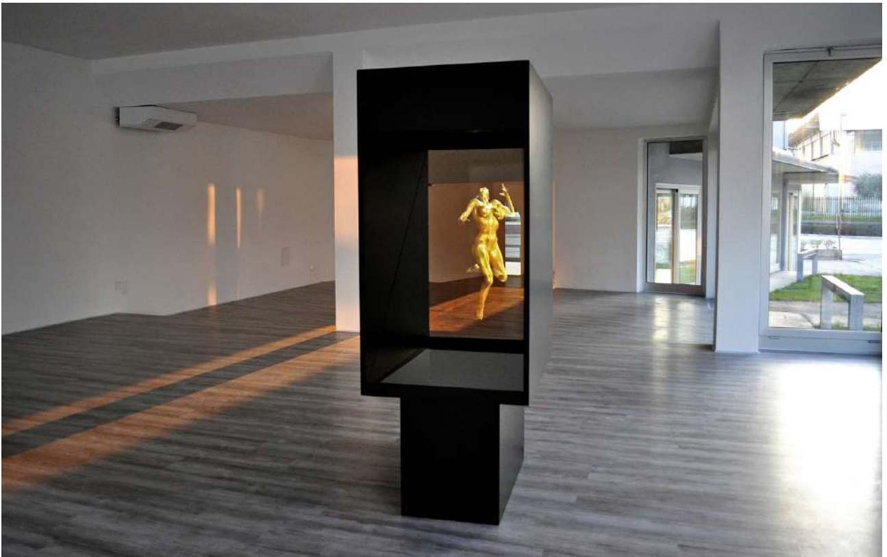
Christian Zanotto - Holographic Theca / Animated virtual sculpture "Aktor" / Digital mixed media - 2014

To request other images, high resolution files or more material please contact: press@redstampartgallery.com