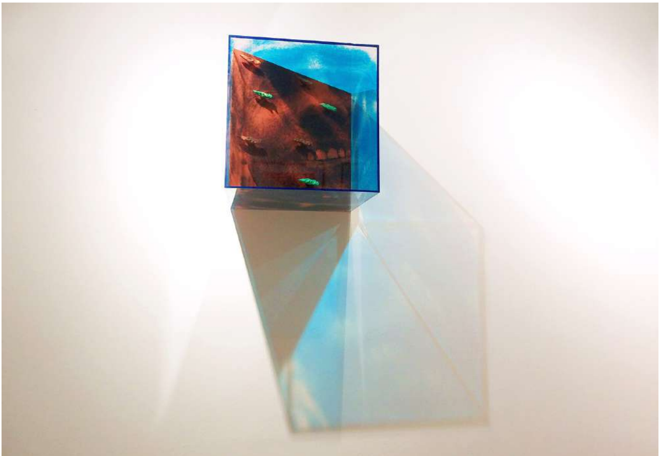
Francesco Candeloro – Eyes 49 Kay – Industrial airbrush on plexiglass / Mixed technique – 2004