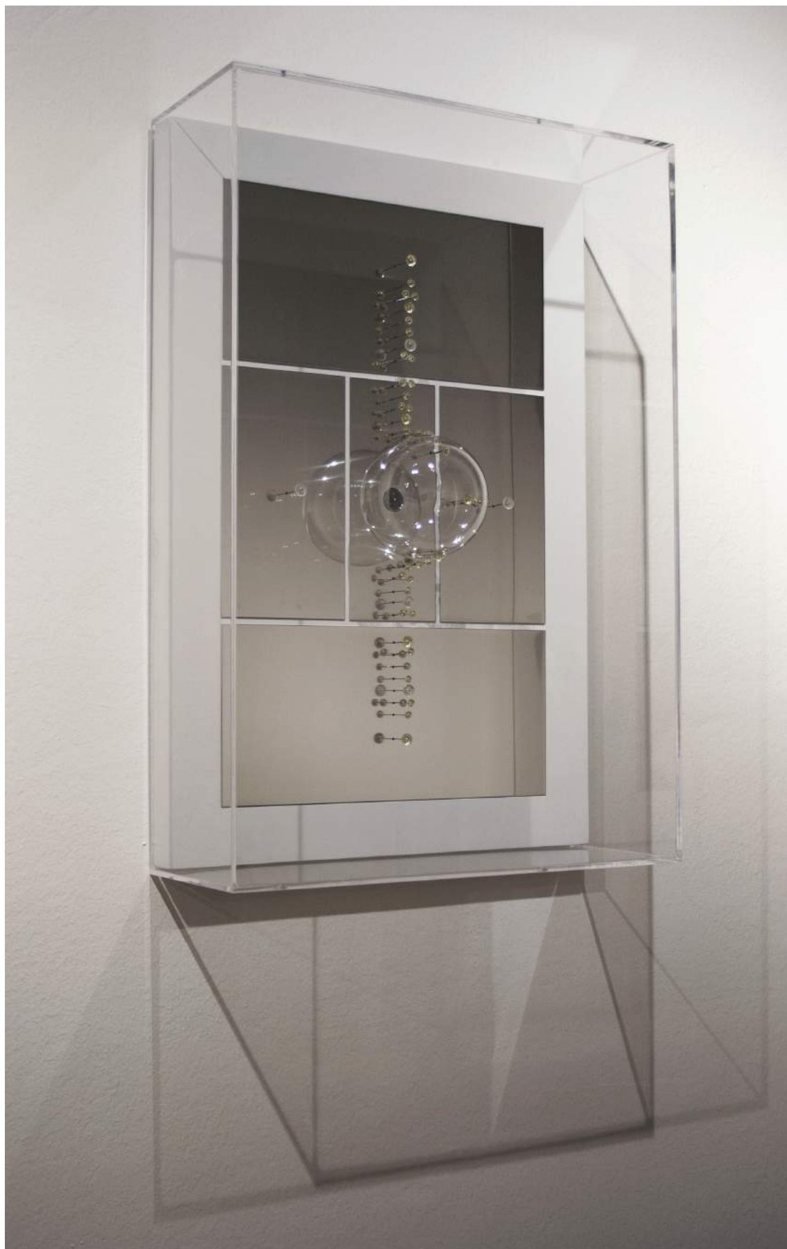
NEOSFERE 5 - cm. 40 x 60 x 15

ARTWORKS FROM THE "NEOSPHERES" SERIES – 2010/2011 BLOWN GLASS, STEEL, SILICON, PLEXIGLASS