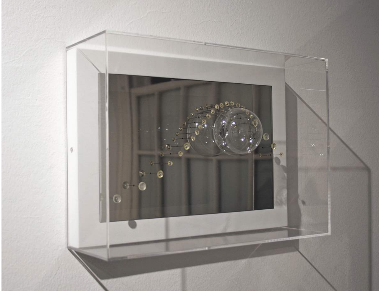
NEOSFERE 3 - cm. 36 x 26 x 12