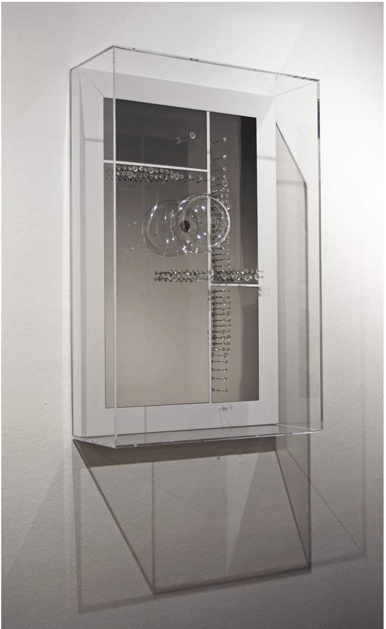
NEOSFERE 6 - cm. 40 x 60 x 15