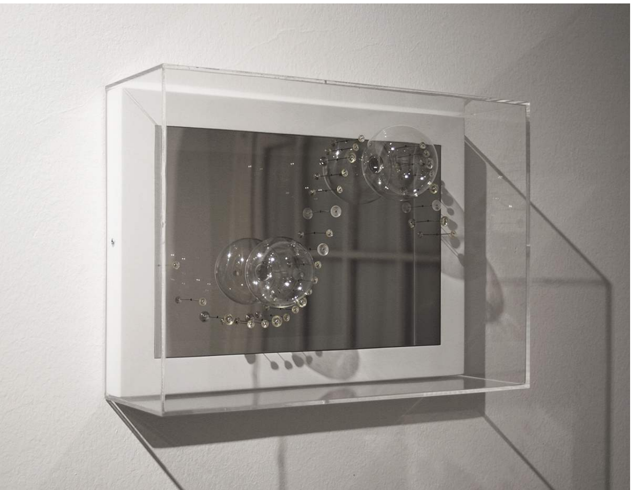
NEOSFERE 2 - cm. 36 x 26 x 12